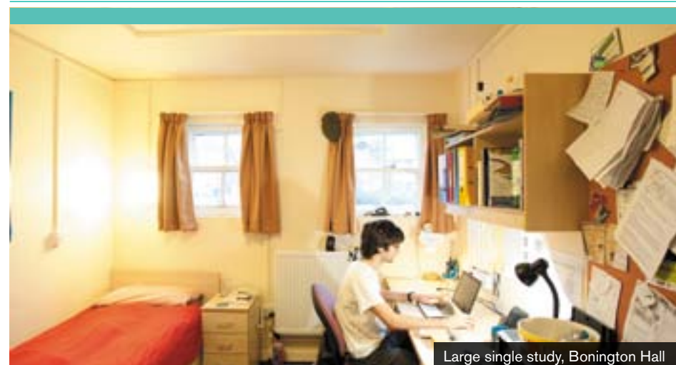
Large single study, Bonington Hall